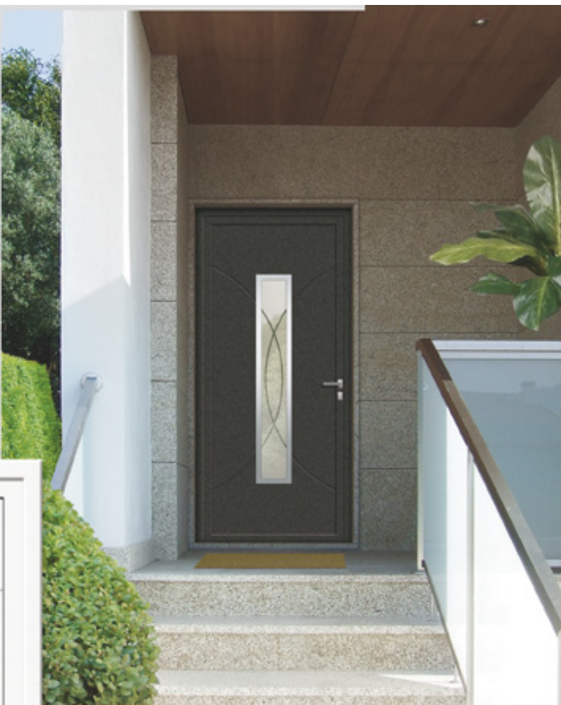
s 100 noir