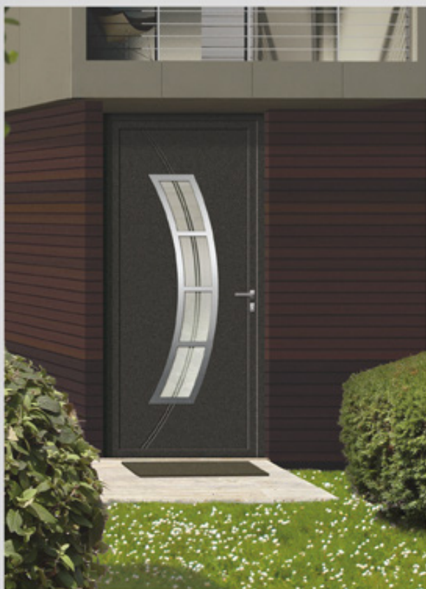
s 100 noir