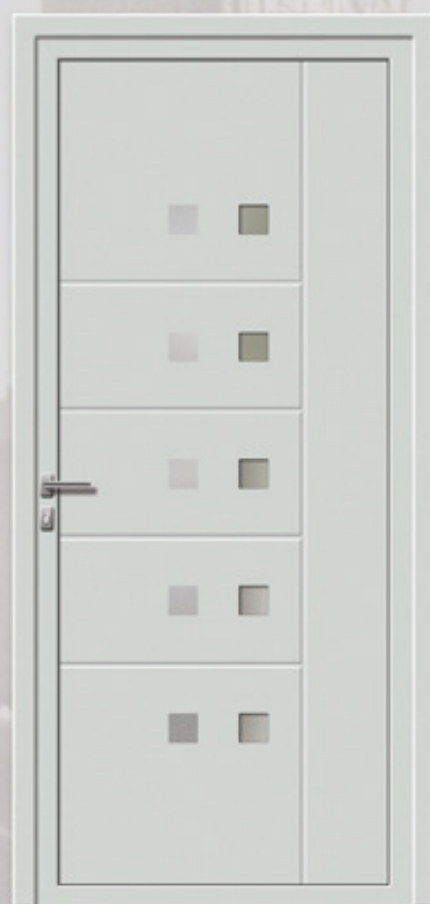
NG2 ral 7035