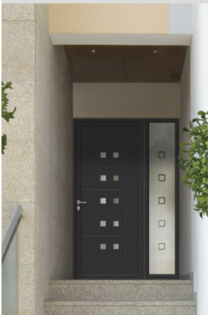
TVNG2 s 200 noir