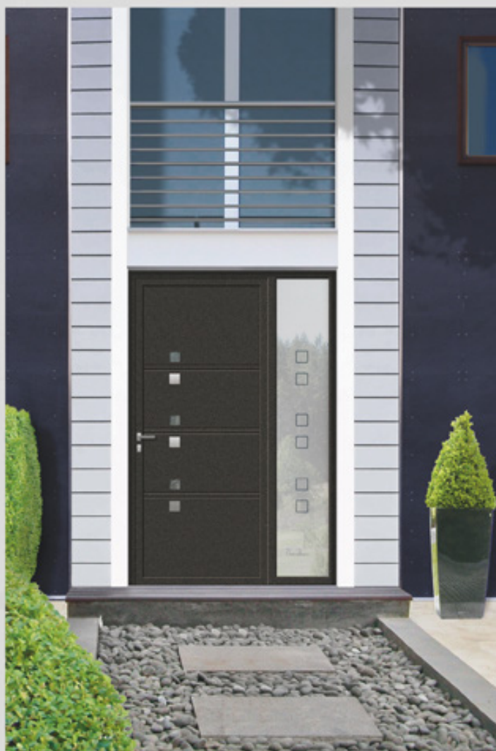
TVNW2 s 100 nör